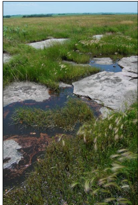
Rare natural community example: Ephemeral wetlands associated with a Southern Bedrock Outcrop native plant community.

The DNR's Natural Heritage and Nongame Research Program (NHNRP), in collaboration with the Minnesota County Biological Survey (MCBS) identifies, describes and maps rare and high quality native plant communities in the Natural Heritage Information System (NHIS). 1 Since the term "rare natural community" is not defined in the WCA rule, this guidance is provided to clarify which native plant communities are applicable to the rule section above. Rare natural communities identified under this WCA rule provision often support endangered and threatened species. However, please note that there is a separate "Special Consideration" in the WCA rules pertaining to listed species (8420.0515, Subpart 2).