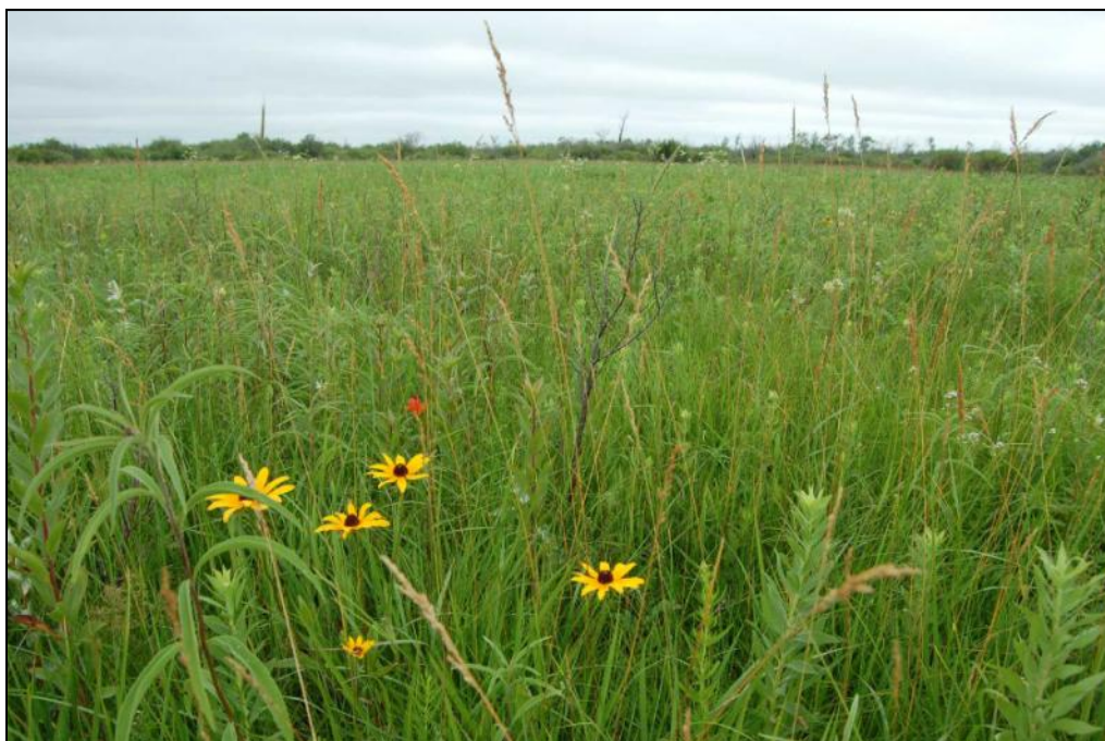
Rare natural community example: Northern Wet Prairie in Polk County.